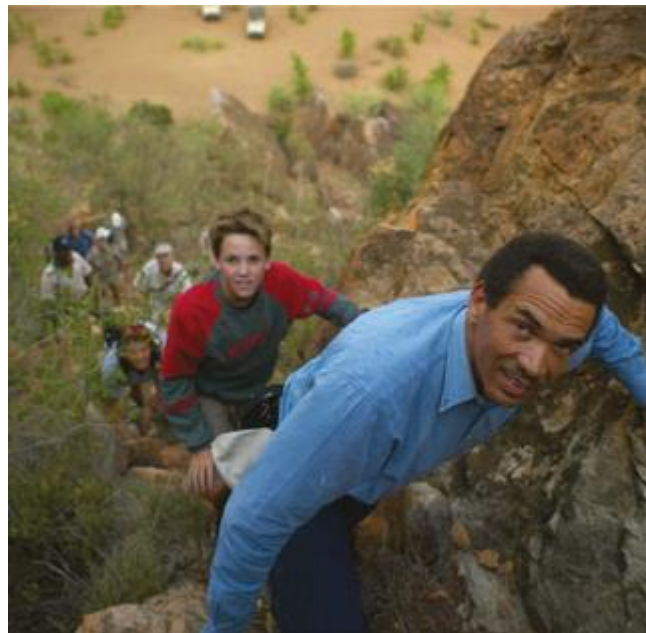
Source 1: Platinum Grade 6 Social Sciences Learner's Book, page 105

7. Study the picture below then answer the following questions.